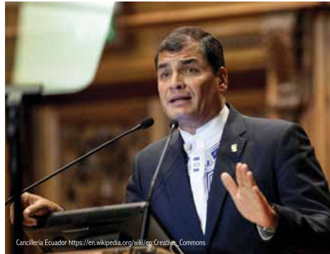
Cancilleria Ecuador https://en.wikipedia.org/wiki/en:Creative_Commons

“ Now that the global commodity boom is over, it would appear that the good times are also coming to an end for the socialism of the 21st century governments.