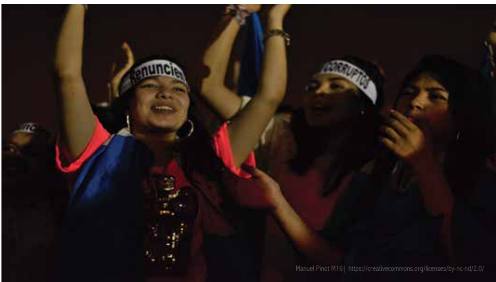
Manuel Pinol M16 | https://creativecommons.org/licenses/by-nc-nd/2.0/

The worst cost of Guatemalan populism, however, has been the way that the political parties and authorities have lost credibility with the public.